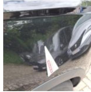
Repair Type Spray Acceptable No