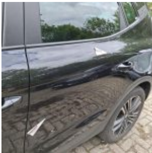
Damage Part Reardoor - Left