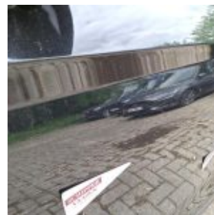
Repair Type Spray Acceptable No