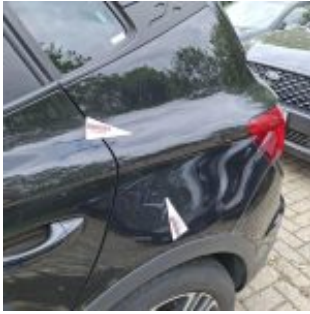
Damage Part Fender - Rear Left