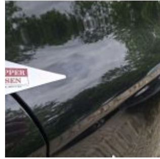
Damage Type Scratch(es)