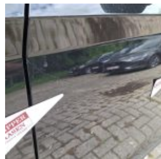
Damage Type Scratch(es)