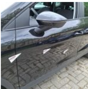
Damage Part Frontdoor - Left